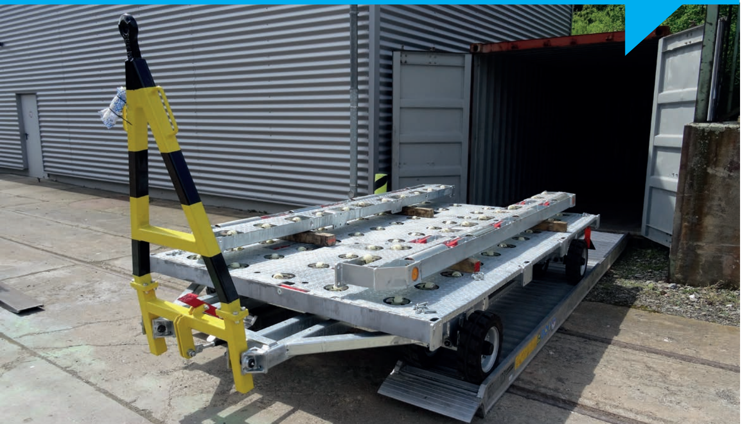
figure: D 10. 111-C-L

The dolly D 10. 111-C-L of the Blumenbecker Technik GmbH is faster transportable and maintenance-friendly . The dolly D 10. 111-C-L is also intelligent and adaptable .